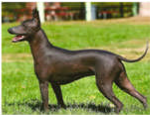
Xoloitzcuintli / Lesley Mattuchio

The Xoloitzcuintli (pronounced show-low-etz-queent-lee) is one of the world's rarest breeds and is still considered a "healer" in remote Mexican and Central American Villages today. The breed comes in three sizes: toy, miniature and standard; and two varieties: hairless and coated, which makes the Xolo ideal for those looking for a dog with more variety. They serve as an excellent companion for families due to their attentive and calm nature and require moderate exercise and grooming.