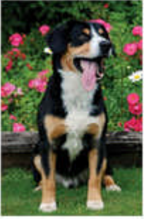
Entlebucher Mountain Dog

The Entlebucher Mountain Dog was bred to move cows from pasture to pasture in the Swiss Alps. The breed is medium-sized and prized for its agreeable nature, trainability, and devotion. Entles are an active, high energy and physical breed with above average exercise requirements, so they are best suited for active families and not the casual dog owner. Additional facts on this breed can be found on the National Entlebucher Mountain Dog Association's website at: www.nemda.org