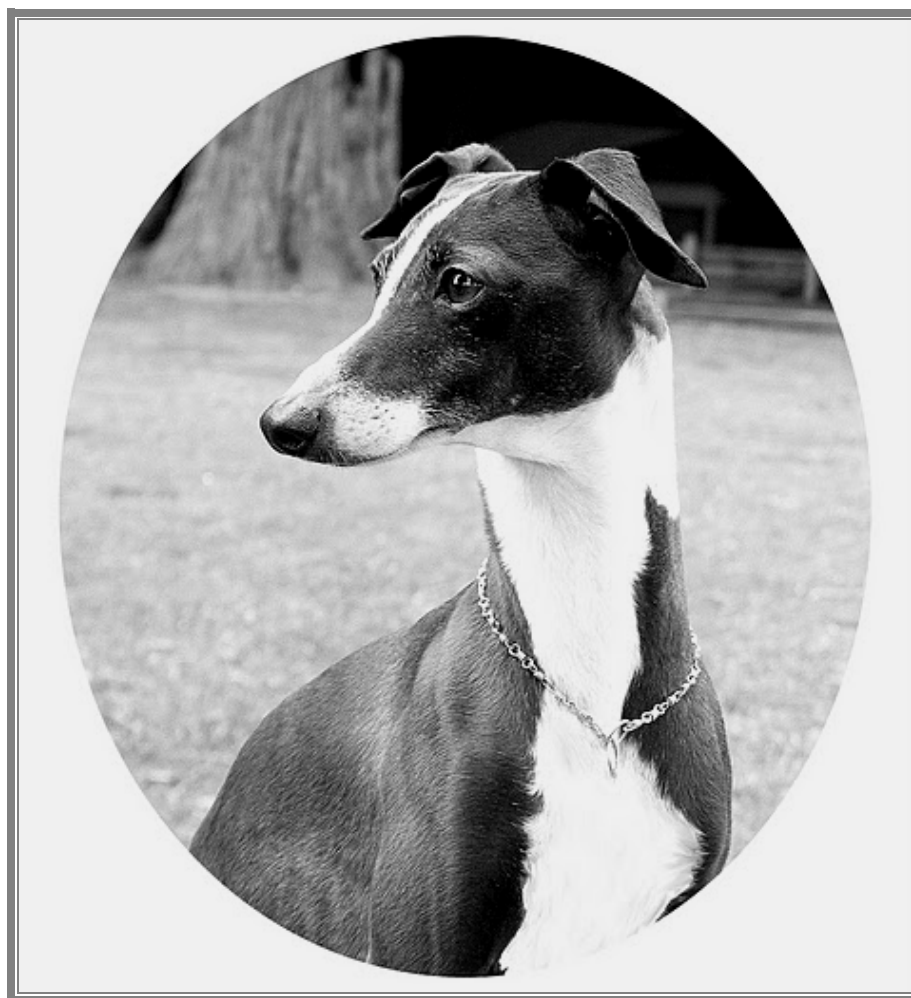
CH JO-NA-DA'S HERSHEY'S KISS

Now that Wrapper is finished, I'll be bringing out his half brother, Runner, who has proven himself to be a natural showman.