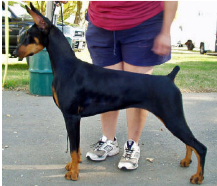
Above: Jamaica being stacked by her breeder.